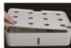
Planting water tank