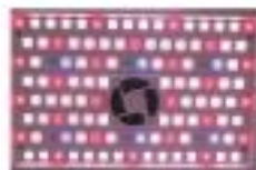
Plant fill light lamp