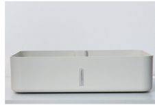
Planting water tank