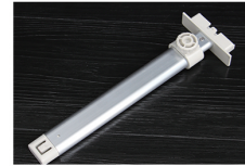
Adjustable Support Rod